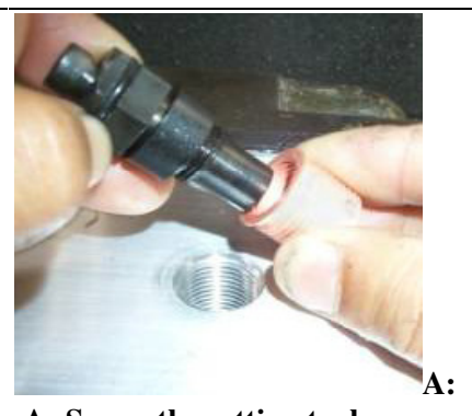
A: Screw the setting tool into the insert.