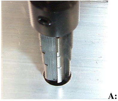
A: Ream the hole until black stop collar touches the head.

The reamer will also cut the Countersink for the flange of the insert to seat into. When you start getting close to the stop collar coming in contact with the head, you will want to clean the chips from the reamer so you have a positive stop on the head without having any chips interfering.