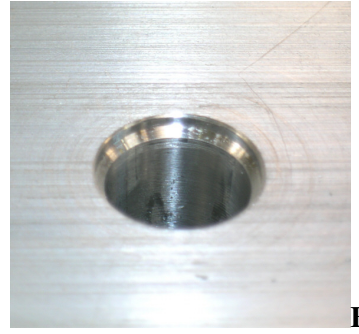
This will create the 45 degree countersink seen in picture "B"